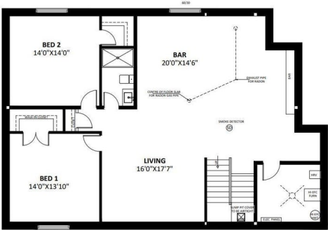
BASEMENT PLAN - 1538 SQ FT