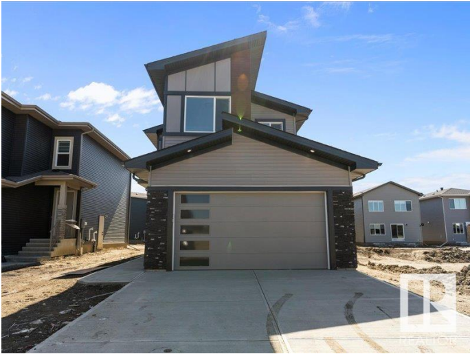
1805 60 AVE BEAUMONT AB EXTERIOR WALL THICKNESS: 8.5"