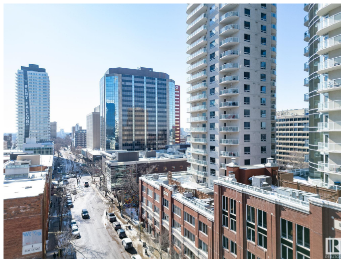
701-10136 104 Street NW, Edmonton, AB